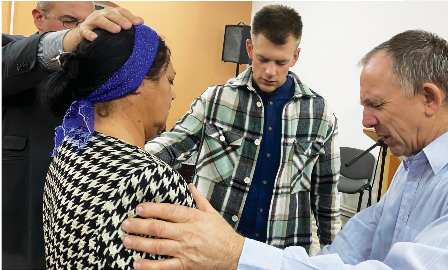
A mother in Romania accepts Jesus Christ as her Savior.