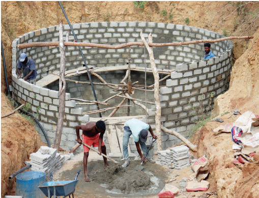
A community of villagers in Sri Lanka came together to construct a well for agricultural use.